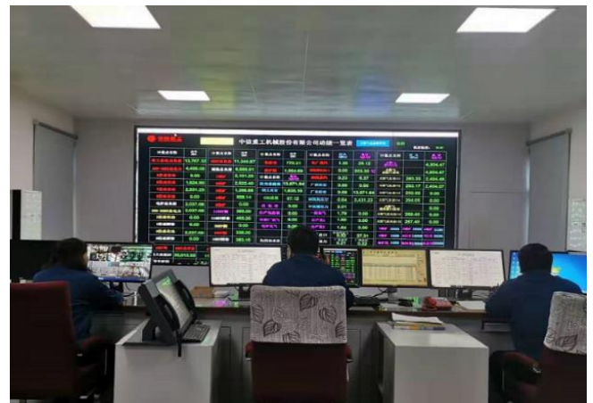
"Internet +" Energy Control Center

(1) From the advanced monitoring means and the strong ability of timely collecting & processing data by Internet + Energy, calculating the Natural Gas Consumption in heating or during heat treatment process, comparing and optimize the heating (heat treatment) process. The Gas Demand Side Management System is adapted for real-time monitor and analyzing the operation of each natural gas furnace, so as to continuously tap the energy saving potential and reduce the energy consumption level. The Production Dept. reasonably arranges the charging plan, and Management Dept. adopts the management means such as On-site Inspection and sending the Inquiry Letters to the problems, to continuously improve the Charging Rate and Working Cycle of each natural gas furnace, so as to greatly improve the working efficiency of the natural gas furnace, thus reducing the consumption of natural gas and the consumption of natural gas for single product.