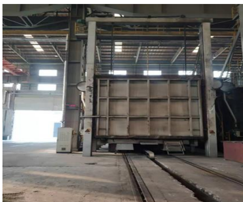
Ordinary Natural Gas Furnace before Retrofitting

In addition to consuming Natural Gas, Natural Gas Furnace also consumes air (assisted combustion) during working. Before the Retrofitting, air in the same ambient temperature was directly sent into the High-temperature Furnace by the blower, which directly affected the furnace temperature and caused the furnace temperature to drop. In order to compensate for the drop of temperature, Natural Gas Consumption had to be raised. At the same time, due to the temperature fluctuation, product quality was affected. The air preheater is added in front of the furnace, and the high-temperature residual heat of the flue gas is used to preheat the low-temperature air first, so as to raise the air temperature entering the furnace and reduce the influence of low air temperature on the furnace temperature, thus reducing the consumption of natural gas and improving the thermal efficiency of the furnace. At the same time, new insulation materials are used to reduce the furnace heat loss, further reduce the consumption of natural gas.