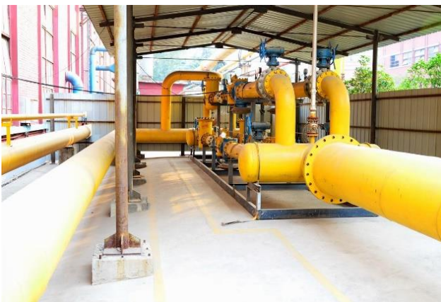
Gas Regulating Station

(2) Combined with the Heating Curves and Heat Preservation Curves of the parts in the furnace, the pressure and flow of natural gas can be calculated and controlled to minimize the cost of natural gas.