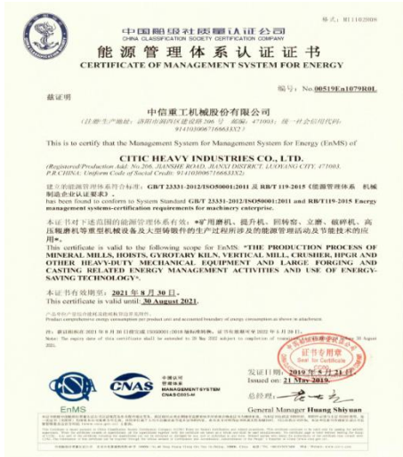
Certificate of Management System for Energy

2. In the bidding publicity materials, we promote the "Certificate of Management System for Energy" to our customers.