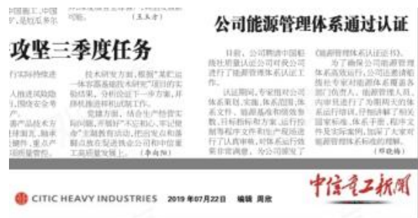
News Column of the Enterprise's Website

1. CITIC HIC obtained the "Certificate of Management System for Energy" on May 21st, 2019, and announced it in the news column of the enterprise's website on July 22nd.