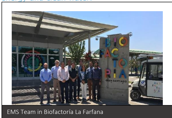
EMS Team in Biofactoría La Farfana

To convert all waste into usable resources, energy and clean water.