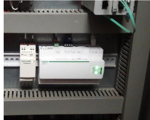
Energy Measurement Equipment (COM'X)