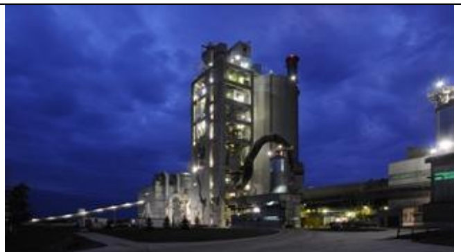
St Marys Cement – Bowmanville ON, Canada

First ISO 50001 Certified Industrial Facility in North America