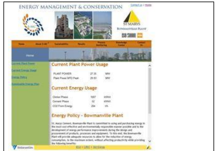
E=MC2 Intranet Website

The Bowmanville Plant has published and continuously updates its Sustainable Energy Plan. This document, maintained by the E=MC 2 Committee, outlines the energy program at the plant. Items in the plan include the energy policy as well as procedures for results validation, saving opportunity assessments, goals, measures and planned actions. Energy management is part of new employee orientation to emphasize the importance of this program. The E=MC 2 committee meets weekly to review open action items as well as to explore new items that may improve the energy program. Process energy data is displayed on our control system screens for the operators and an energy management display was created to provide immediate energy status information at a glance. In addition to this, process alarms were created within the control system as well as the company email system to notify management of changing energy costs or abnormal conditions.