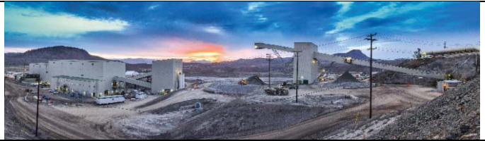
Sunrise at New Afton Mine

New Afton is the first mine in North America to implement ISO 50001.