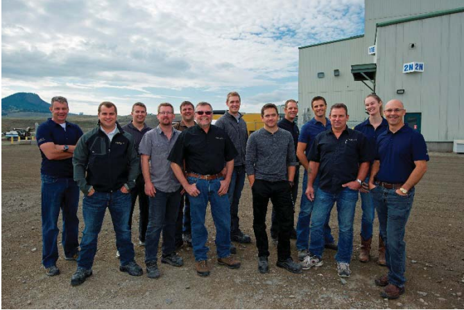
Figure 1. ISO 50001 Implementation Energy Team

planning process and are part of the Top Management performance contracts.