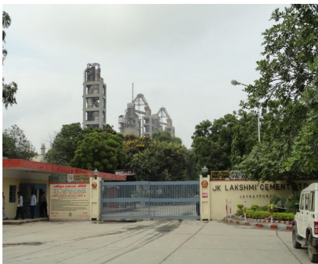
JK LAKSHMI CEMENT LTD – JAYKAYPURAM, SIROHI PLANT

Successfully achieved 14.82% reduction in the SEC, as against given target of 4.91% during "PAT"- Cycle-1 (SEC= Specific Energy Consumption)