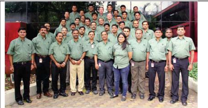
Newly trained Energy Champions in India are ready to improve energy performance.