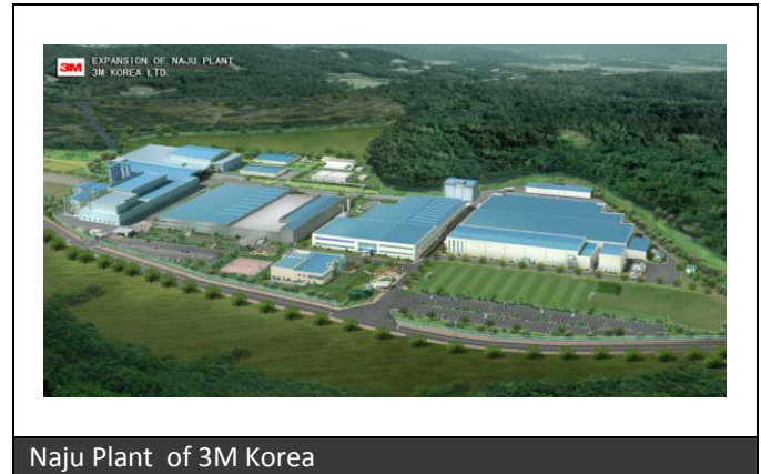
Naju Plant of 3M Korea

3M Company has a long history of caring for the environment. 3M Korea also has made our effort to contribute to 3M strategic objectives. In 2015, 3M Korea Naju plant, one of 3M international subsidiary, had worked with KEA (Korea Energy Agency), to implement energy management system. Naju plant obtained certification of the ISO50001, global EnMS standard and is the first company in Korea achieved Superior Energy performance (SEP) from KEA. Naju plant's EnMS implementation enable 7.14 percent improvement in energy performance in 2 years.