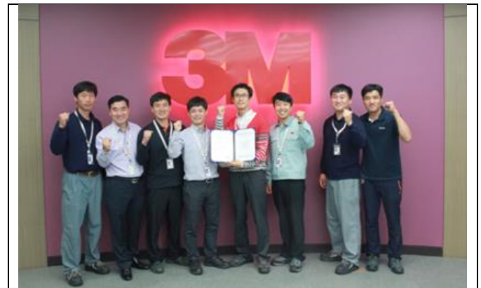
3M Korea Naju Energy Team

The Naju energy team have carried out from metering and performing projects to employee education