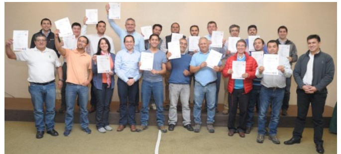
Figure 5. CMPC ISO 50.001 energy teams training

Development and use of professional expertise, training, and communications: In our EnMS people are considered as a vital element of its performance and long term value generation capability. Constantly, training necessities and knowledge requirements are reviewed, thus ensuring up to date tools and motivated energy team members. There is a special focus on people who have an impact on each plant significant energy uses. In this context, the focus is to have the following annual programmes on training in ISO 50.001 interpretation and awareness courses for all functionaries, internal and leading auditor courses for energy team members. Moreover, certified courses like CEM and CMVP are also taught to leading energy team members. Furthermore, communicational programmes establish a continuous use of material such as videos, intranet columns, posters, leaflets and stickers in order to disseminate awareness campaigns. These campaigns have been the importance and daily effects each worker has in our energy performance and to show the achievements met through the EnMS.