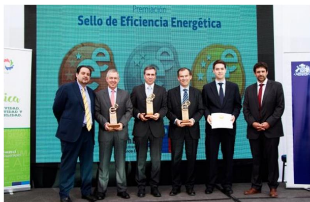
Figure 1. CMPC obtained the Gold Energy Efficiency Seal by the Chilean Ministry of Energy, along with the prize for best implemented energy efficiency project.