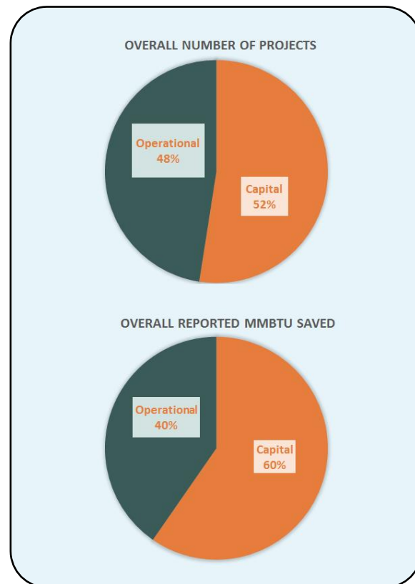
Project breakdown by type from data reported to SEP program

Although the SEP program has been vital at promoting technical expertise and awareness in EnMS, it does not provide funding for capital investment in EMDS or other energy efficiency projects. However, 48 percent, almost half, of the projects reported voluntarily to the SEP program could be considered non-capital or process-based energy improvements, and these projects accounted for approximately 40 percent of the estimated reported energy savings. This pattern holds true for EMDS implementations as well: approximately 48 percent of the EMDS projects that were driven by the EnMS were operational in nature and tended to be low- or no-cost low-hanging fruit projects, such as more effective shutdown procedures for equipment. It is evident that a beneficial aspect of an EnMS is its ability to help identify these lower-cost improvements.